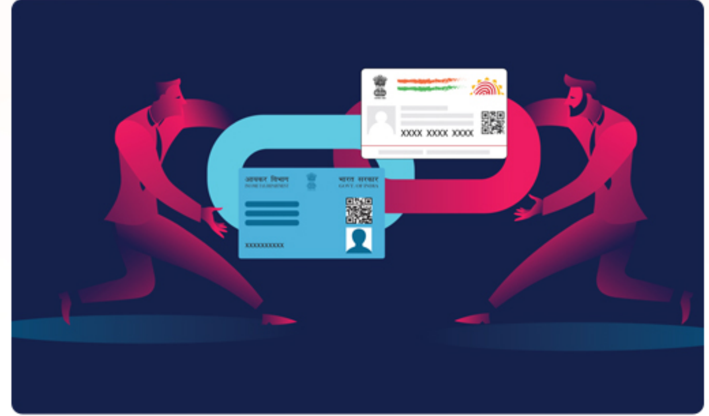
Feature Update with TdsPac & SalTds